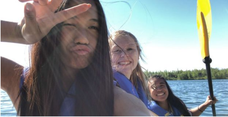
boat buddies blessed with bomb weather

During recreational time, Denali girls spent time outside enjoying the sun. The girls learned how to ride paddle boats for the first time and had access to kayaks and canoes. "We needed that break, it was the most fun I've had all weekend," said Ruvelyn, Denali's City clerk. The weather conditions were perfect for swimming, photo shoots, and relaxing on the grass.